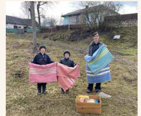
As temperatures plummet, a family in Ukraine receives blankets and food through SGA-supported Compassion Ministry.

infrastructure have left thousands without heat, and power outages are frequent. Your faithful prayers and support help the faithful churches SGA serves reach out to needy individuals and families who are thus afflicted—and so much more. You help provide Bible-training, Bibles and Christian literature, children’s ministries, food, and other compassionate aid to equip the churches for their ministries. We are so thankful to the Lord and to you. Please pray about how you can help today. ♦