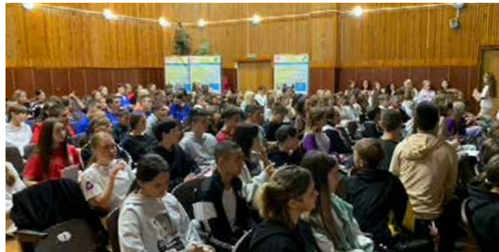
Summer camp ministry to teenagers.

It so happened that the things we thought would be a big problem turned into a new opportunity in the changed situation. Instead of the 40-50 whom I