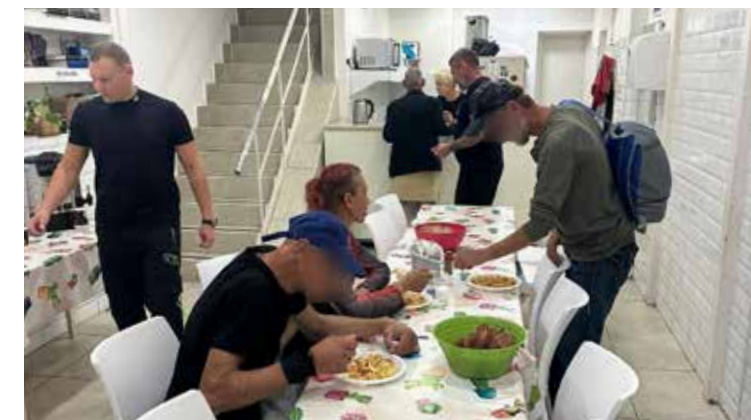
Believers at Aviv Center provide hot meals to those struggling with homelessness and drug addictions in Israel.