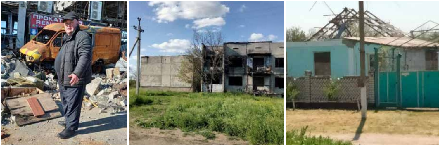
Trip to the Kherson region.