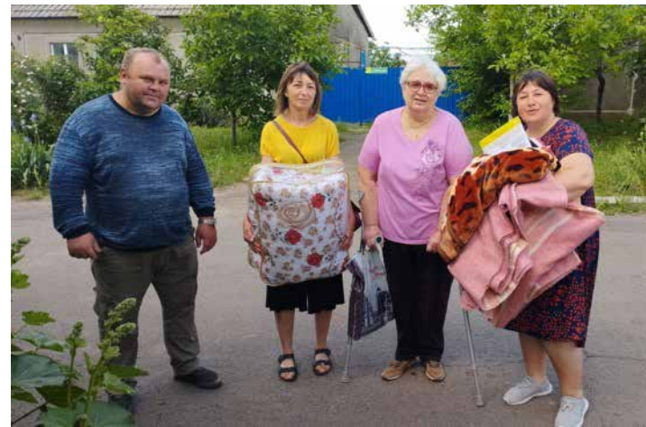
Distributing aid to families in need.

We also continue the service of helping displaced people. There are more of them every Sunday, especially from the Kherson region. We help with everything we can, some with medicine, clothes, and some with shelter. We distribute products to all of them. We do it after the worship service. We ourselves are amazed at how God works in our region. People constantly came to the church for help, but now they come to listen to the Word of God! This is how God leads our church, which opens up new opportunities for serving people.