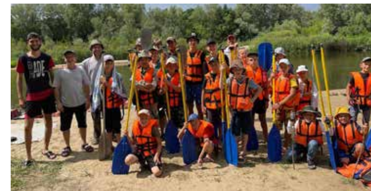
Rafting trip with the youth.

Another part of our ministry over the summer was rafting with youth. We thank God for the opportunity. They met with other teens, stayed in tents, and went along the river on the rafts.