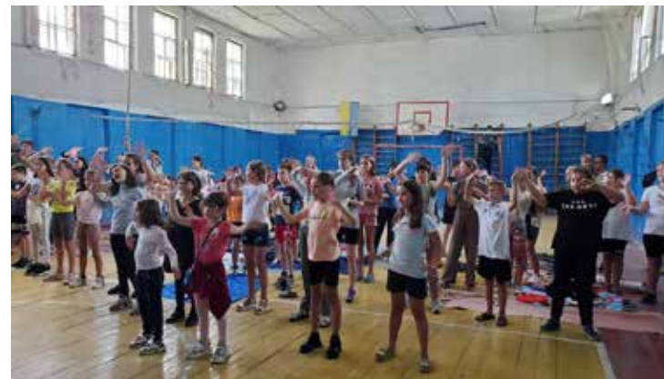
Day camp for children.

We are looking forward to summer camps already. Last year, throughout the summer the Lord blessed us with the opportunity to hold a children's day camp . We were allowed to do it at the village stadium and the sports hall of the local vocational school.