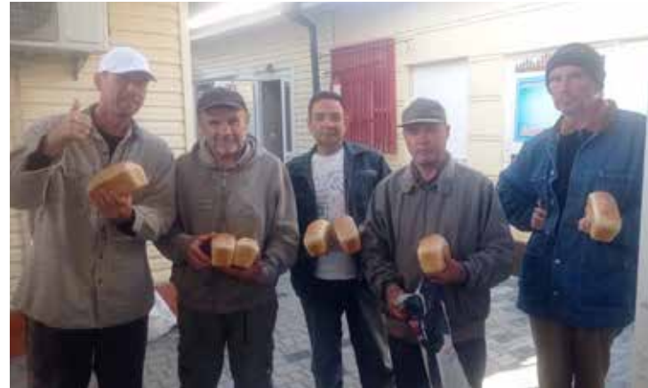
Distributing bread to people in need.

Our church has a bakery, and now we provide hot bread to homeless people and children in one of our towns. Our brothers and sisters visit there for ministry, conducting sessions with children and adults.