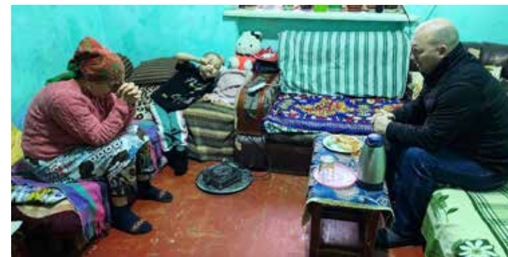
Praying for the child with cerebral palsy.