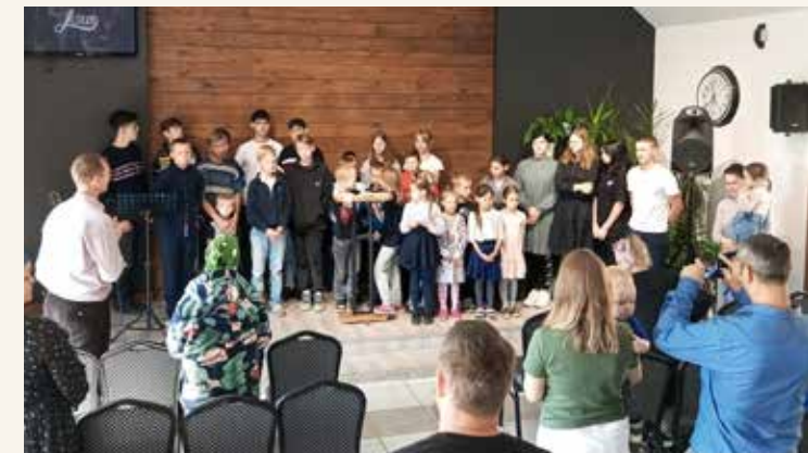
Children participate in the church service.

Our church is praying for a youth leader—this is our need. We thank the Lord that our services are being attended by people who do not know God. We work with them, praying that the