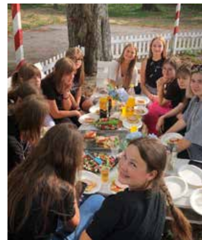
Ministry for teenage girls.

held for children to study the Scriptures at their level. Each week we had approximately 20-25 little friends attend these classes.