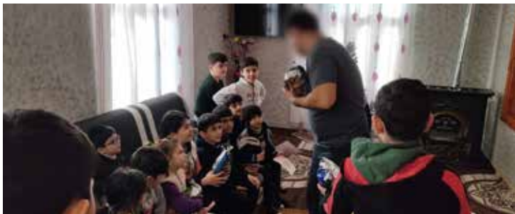
IC program in a predominately Muslim region.

A faithful pastor in a former Soviet and predominately Muslim region attempted to hold an Immanuel's Child Christmas program and, as the church reported to us, was immediately arrested.