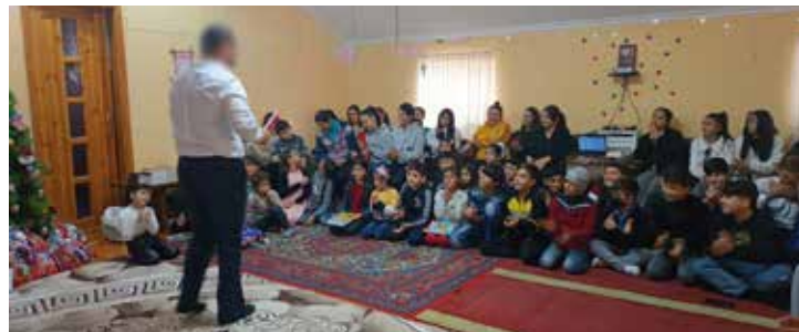
Testifying about Jesus at an IC outreach.

"He was asked questions and he answered them, testifying about Jesus that He is the Son of God and the Savior. He referred to the Bible, citing some passages from the Bible and the Koran, and the two policemen listened very carefully. One of them remembered that Christians once treated him very well when he was at another job, and the other asked how to make a Savior save you. The pastor told them, and this policeman said 'Amen, that Jesus is the Savior.' When they arrived at the police station, the bosses began to threaten and accuse him of terrorism, and these two policemen tried to defend him. It took more than seven hours before they were released. He was then summoned to an "anti-terrorist" office the following day, where he left copies of the New Testament and again shared the Gospel. After being released again, he went to the next village and held an Immanuel's Child-supported outreach."