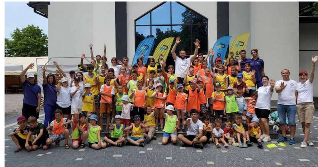
(Above Left) Children at the camp; (Above Right) Children study the Scriptures.

There were 110 children who visited the camp, and adults were also present. In a different village, children's evangelistic meetings were held on every other Saturday. There were more than 100 children and adults who came to these meetings every time. The meetings were filled with fellowship, games for children, Bible lessons and much more. After these meetings, more children began to attend Sunday school classes. Also on Saturday, classes are