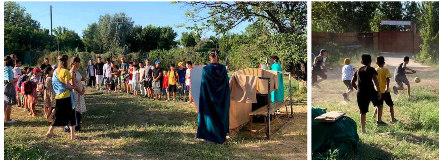
Children participate in activities at the camp.

To her joy, Arsen accepted the invitation and