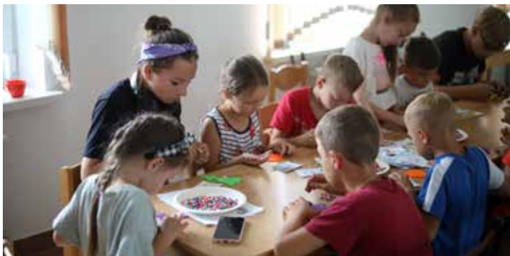
Children work on crafts during the camp.

Dear brothers and sisters, I greet you with the love of the Lord Jesus Christ! Praise God, our church in a local village held a Vacation Bible School (VBS) for children and teenagers. There were 29 children in attendance, and 17 of them were from unchurched families , mostly from large families. Each day we had general assemblies, Bible lessons with children divided up into squads, art lessons, camp sport games, and of course meals together.