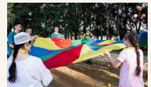
SGA-supported camp for children with Down Syndrome in the Voronezh region of Russia.

helping evangelical churches reach children for Christ across the former Soviet Union. Your support makes this possible, along with provision of Bibles and Christian literature, Compassion Ministry, sound Bible training, Orphans Reborn , and other children’s ministries—and so much more! Please pray about how you can help today. ♦