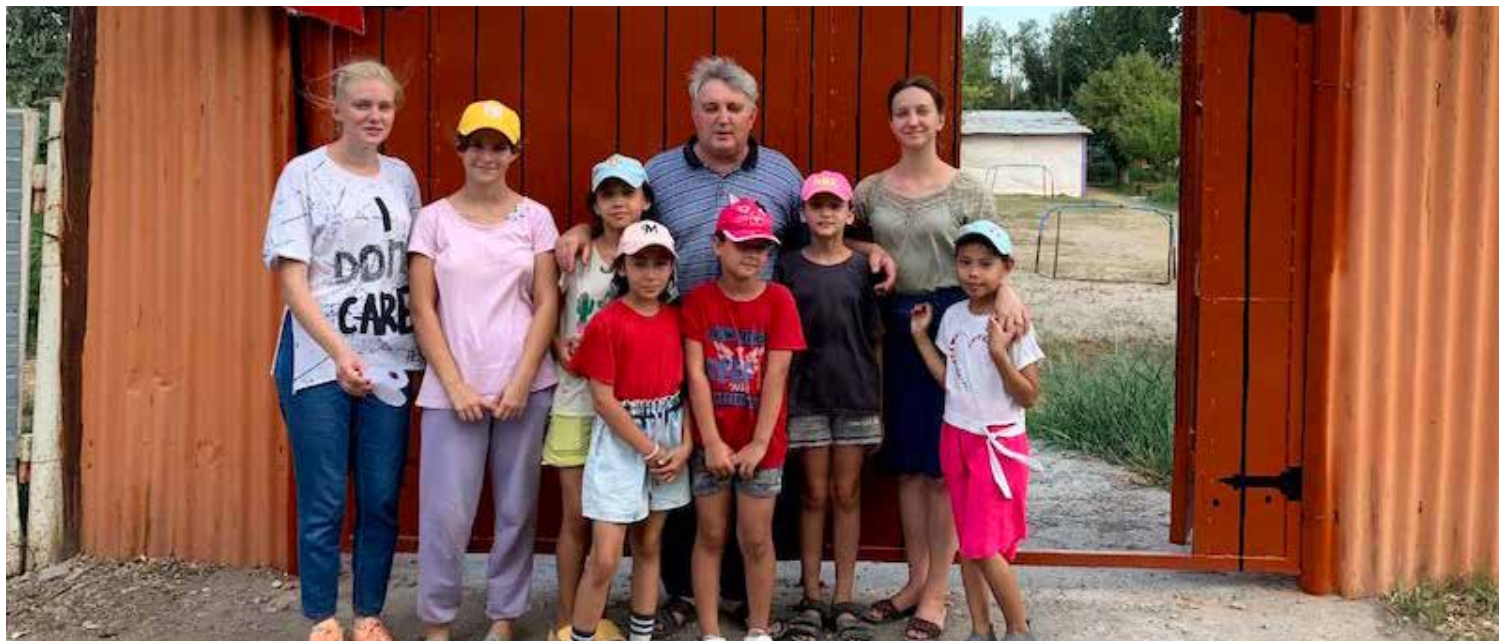
Children at the camp.