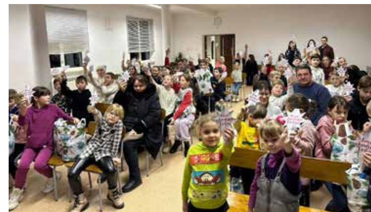
Children with their Immanuel's Child stars.

The atmosphere was very positive and it was evident that the children and adults enjoyed hearing the Good News. Prayers and reflections filled this Christmas Eve service. May God grant that this joy and light may settle in the hearts of each one who