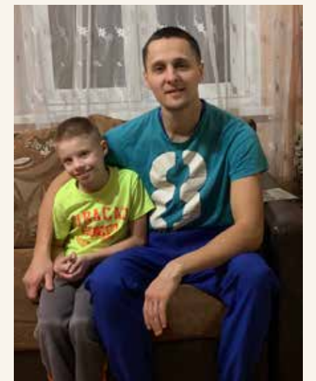
Orphans Reborn ministry in Belarus.