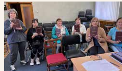
Bible study for internally displaced people in Ukraine.

Reaching lonely, forgotten orphan children is a vital ministry for the evangelical churches we serve across Russia and her neighboring countries. SGA has been blessed to support Orphans Reborn ministry teams for many years now, and we praise God for the eternal impact of this fruitful outreach. You help make this possible, along with many other areas SGA supports— Bibles and Christian literature, missionary pastor sponsorship, Compassion Ministry, other children's outreaches, Bible training, and so much more. Please pray about how you can help today! ♦