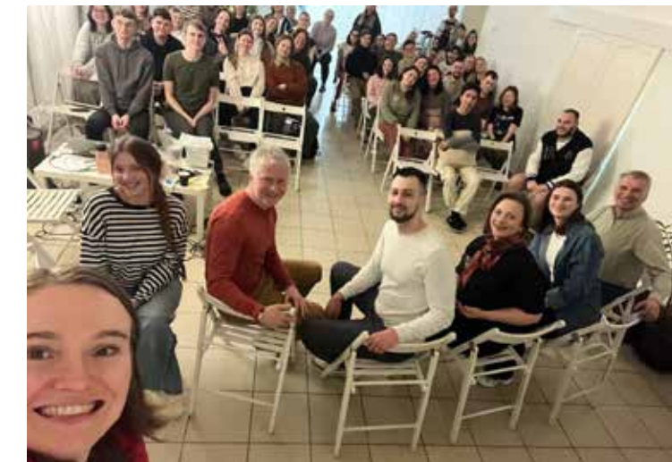
Meeting with unbelieving students.

climbed under the car, and was able to determine the cause of the leak—a worn out and cracked hose. My wife, daughter, and I prayed for wisdom in making a decision as the students were very much looking forward to seeing us! After melting the snow and refilling the radiator, I was able to drive to the nearest gas station. After a slight delay, we were able to reach the destination! The fellowship with the students was just great! After the meeting, the guys and girls came up to me and sincerely thanked me for the help. I prayed that they understood the biblical principles conveyed during our conversation. The goal was worth it, overcoming difficulties to conquer the problems and challenges that arose along the way! We talked for a long time, sharing our experiences and worries. We returned home well past midnight, but our hearts were at peace and deeply satisfied with the ministry we had done.