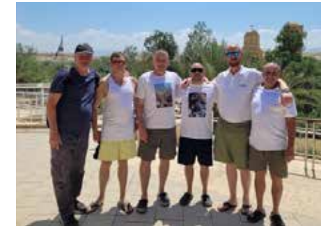
Baptism of several men.

Our students are involved in studying and planting new congregations. They share the Gospel and help those in need of food. Our student pastor recently baptized several men who joined our church. I hope that the Lord will use them for His glory.