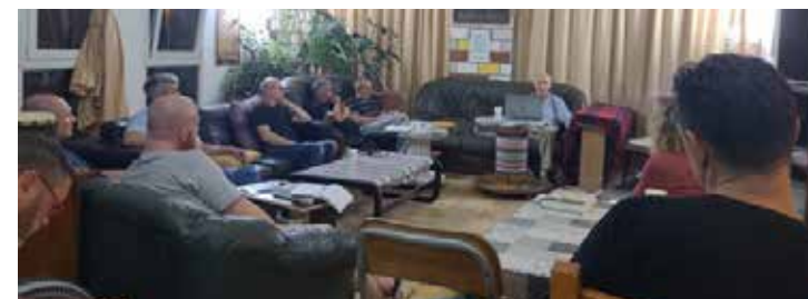
Students in the Eschatology course.

I am teaching an abbreviated course on Eschatology , where we talk about recent events and the imminent coming of Jesus Christ, which is very relevant, especially today. In Ashkelon, approximately