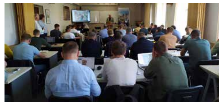
(Top to Bottom) Antioch Initiative training in Yakutsk, Russia; Antioch Initiative training in Azerbaijan; Class at Minsk Theological Seminary in Belarus.

churches! They anticipate as many as 10 locations for this training. Faithful Ukrainian churches are pressing on—despite adversity and chaos—to train more faithful servants.