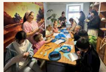
Children's ministry in Kazakhstan.

Your prayers and support also make possible the provision of Bibles and Christian literature, children's ministries, Compassion Ministry, summer camps, and so much more. We are so deeply thankful! Please pray about how you can help today. ♦