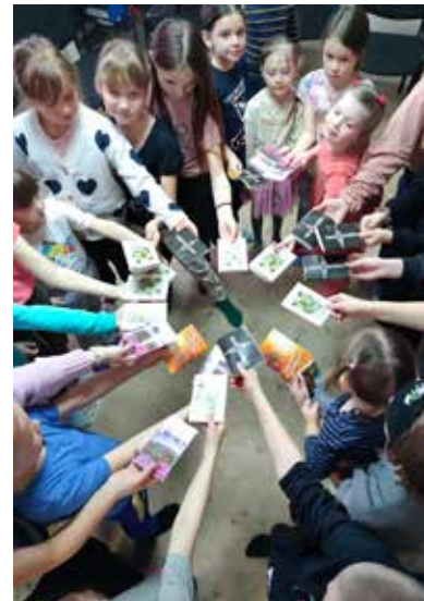
Ministry to children and youth.

ministry activities. Pray also as we continue to build good relations with the regional administration, which will help us to keep having summer tent camps. Pray for those being reached—the children and the needy, the elderly, and youth. May the Lord bring them to repentance. Especially intercede for the children, that love for Christ will grow in their hearts and that the world will not attract them. Please pray also for our spiritual health, that we will not get discouraged. Your prayers and support are near and dear to us—they are always timely! ♦