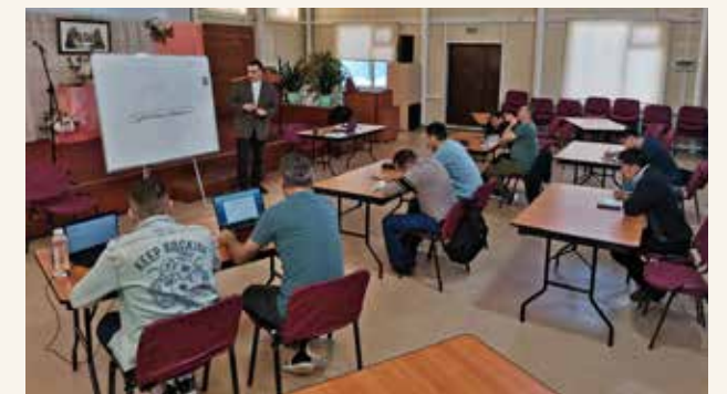
Antioch Initiative training in Yakutsk, Russia.

Since the fall of communist rule in Russia and her neighboring countries more than 30 years ago, SGA—with the faithful help of our partners—has had the wonderful blessing of supporting doctrinally sound Bible training through in-country seminaries, Bible institutes, and church-based Antioch Initiative training. Thousands of pastors and church ministry workers have been trained, and the churches have been greatly encouraged and strengthened.