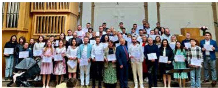
Graduation ceremony for Ukrainian students at an Irpen Biblical Seminary extension center in Prague.

This is happening through SGA-supported seminaries and Bible institutes, along with Antioch Initiative church-based training. Because of the exploding need, we must expand training of men and women for a variety of ministries in their local churches. Ironically, the main campus of Irpen Biblical Seminary in Ukraine has a lower attendance due to Ukrainians leaving the country in the midst