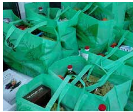
(Above Left) Grocery parcels; (Above Right) Visiting a family with a bag of groceries.

Please, pray for the elderly people that our words about Jesus touch their hearts and that, at the edge of death, they will be able to become reconciled with God.