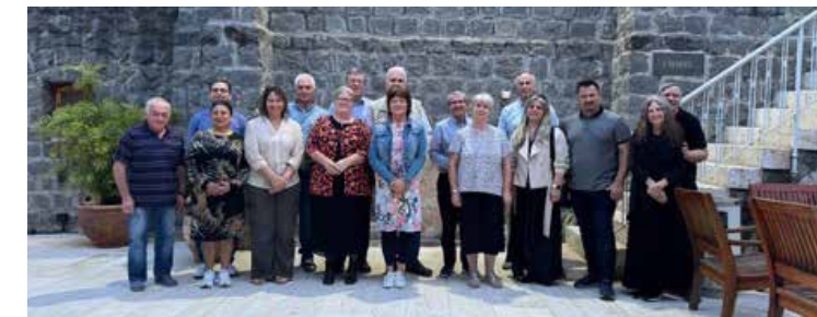
Meeting of church fellowship pastors and their wives.

24 students from three congregations who want to study the principles of Bible study and Homiletics come to classes. We just started this past May. Additionally, in April of this year the Lord gave us the opportunity to spend two days on the shore of the Sea of Galilee. This was the first meeting of our church fellowship pastors with their wives since the outbreak of war on October 7, 2023. There were a lot of questions about service, and we just needed to be together after everything that has happened in Israel since the beginning of the war.