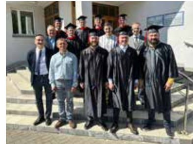
Graduates of Minsk Theological Seminary in Belarus.

In yet another expansion of Antioch training, the Ukrainian Baptist Union is engaged in an effort to train 1,000 men over the next 12 years to be missionary pastors with the goal of 1,000 new