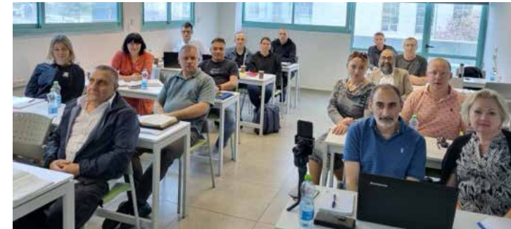
Students of the Bachelor of Theology program.