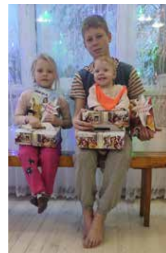
Children being raised by their grandmother.

I want to tell you about two different families with similar difficulties. The kids are raised by their grandmother as the parents are in prison. In one family, the little girl in the arms of the boy is disabled. She cannot walk on her own. These children are especially poor and we try to visit them and spend time with them. They love it very much when we come—we are not forbidden to come, and we can talk to them freely about Jesus. We have sent them greetings from you and in return they send them to you.