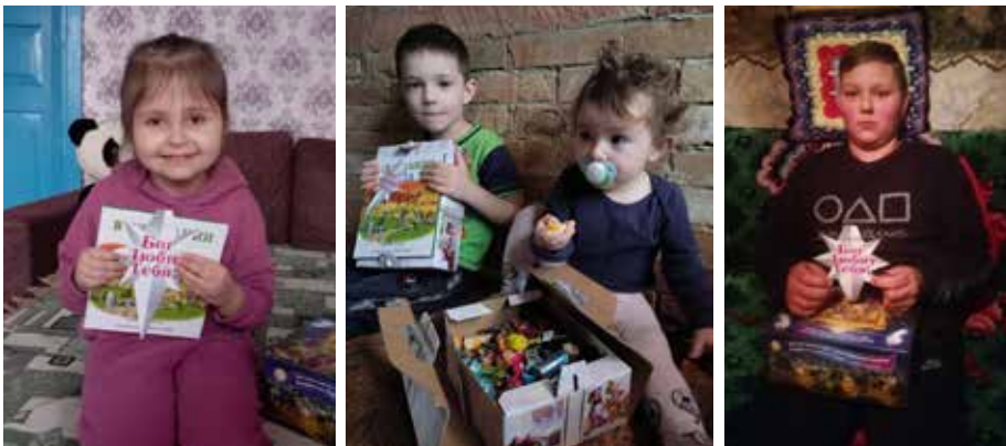
Visiting children in their homes at Christmas.

"Greetings! . . . Children and church members staged a presentation about the birth of Jesus. Between December 24-25, then January 7 and afterwards, there were visits to the homes