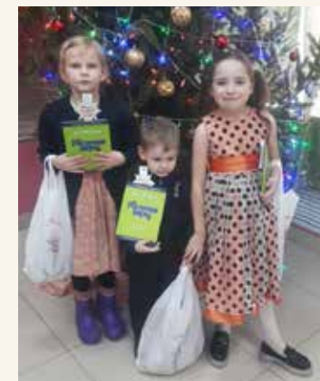
Children at an IC event in Russia's Altai region.

Here we are at yet another summer season come and gone. September is when the fall season begins, but even