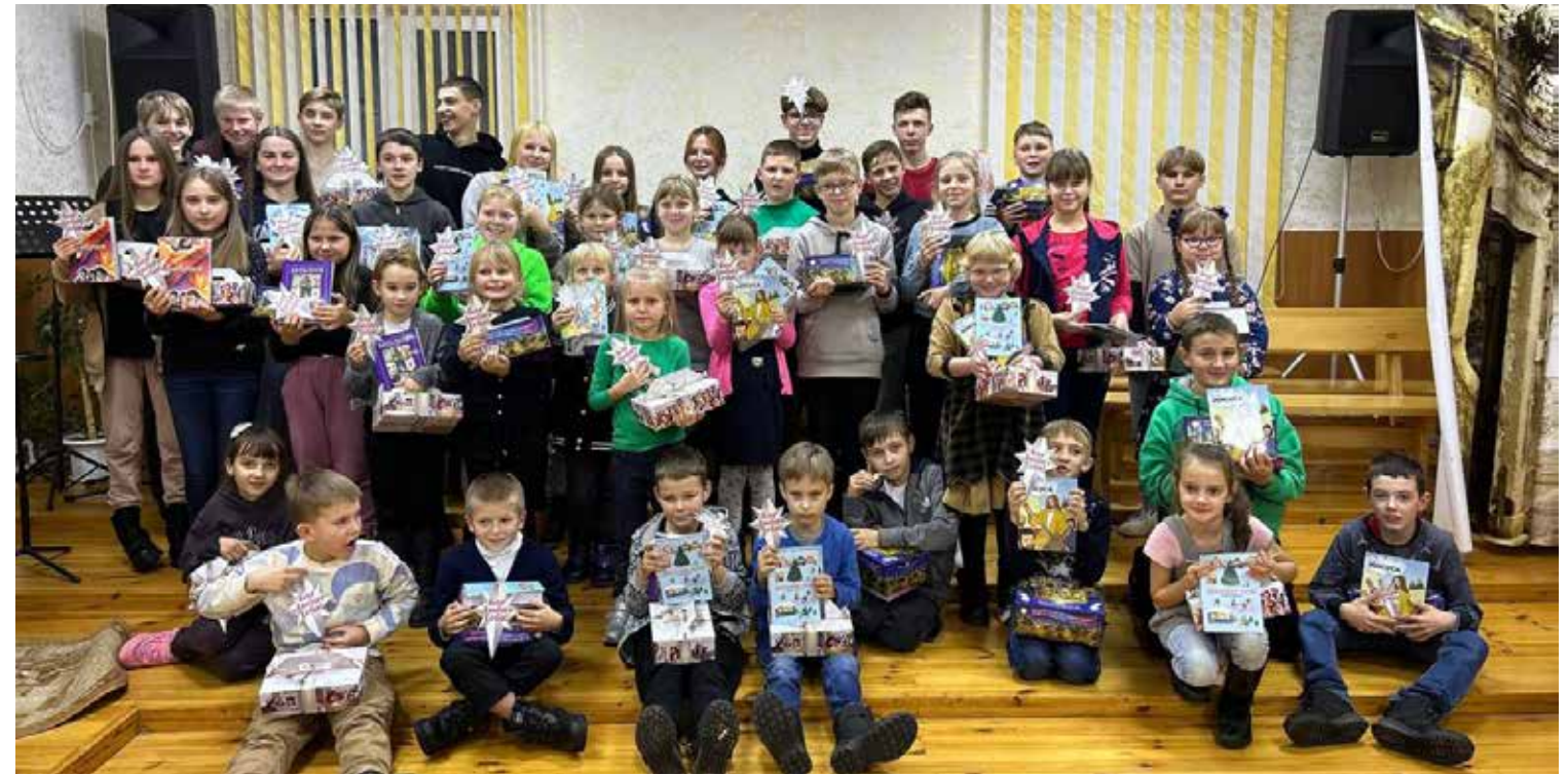
Children at the Immanuel's Child outreach.

of children who for various reasons could not participate in the outreaches.