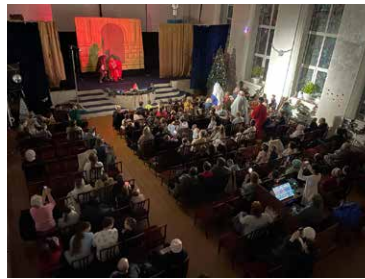
Children at the Immanuel's Child Christmas event.