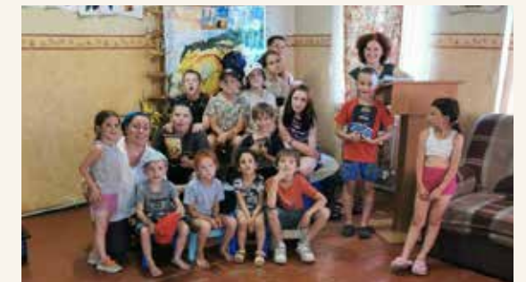
Summer Camp in Belarus.

prayers and support are a great encouragement to them, and your gifts help accomplish so much throughout the year— children's ministries, Bible and theological training, distribution of Bibles and other Christian literature, Compassion Ministry, and much more. Please pray about how you can help today! ♦