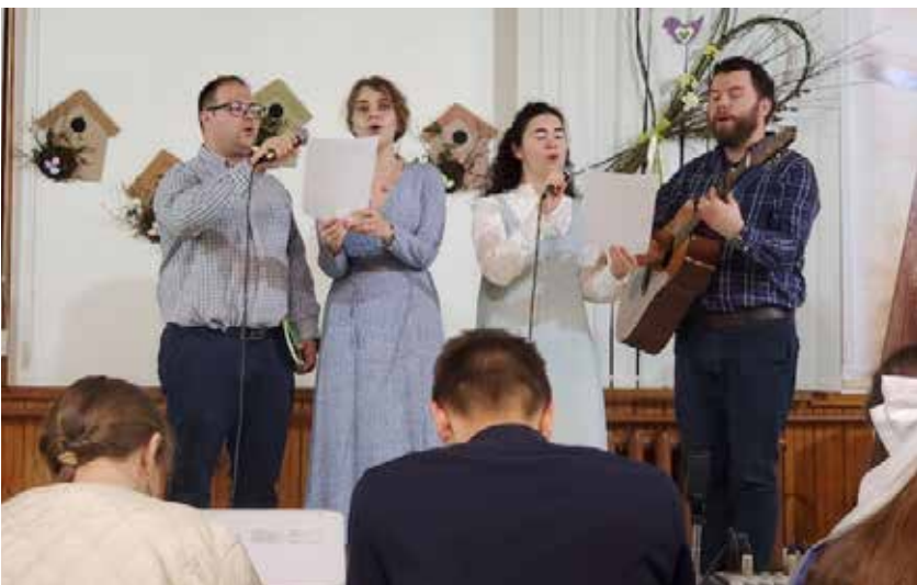
Service in Berezino.

"We were also able to be in a special pre-Easter "All-Night" service this year. On the way to the church in the town of Berezino where we were meeting for Easter, one of the cars stalled. We could not get it started again. We left it right on the road and kept on to the service. It happened that a sister from the church had died that day, and many had gone to the house to hold a funeral. Therefore, there were not many people in the church. But it did not prevent us