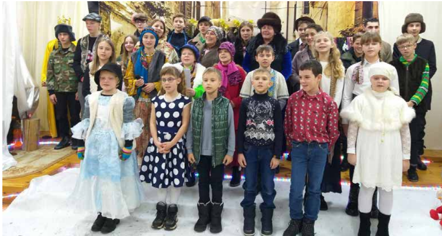
Children perform at the Christmas event.

Pray for another record Christmas—needs are growing!