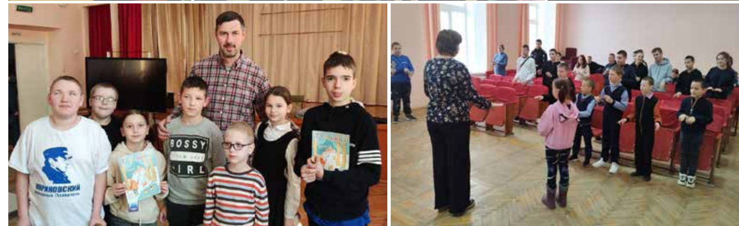
An Orphans Reborn team visits children in Smolensk.