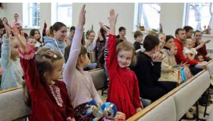
Christmas program for parents and children affected by Chernobyl.

suffer from radiation related to the Chernobyl explosion. The disabled children and families with many children came to our church. We were able to visit five of our daughter churches with a message and a play. There was a lot of joy, gifts, good spirits, and most importantly we shared the Gospel. We are grateful to God for such opportunities to serve!