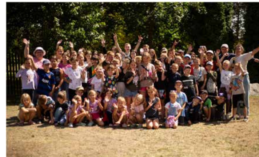
Campers and leaders at the Christian summer camp.

It was also impossible to hold back tears when the children received the gifts. For them it was a real joy—at that moment they felt that they were loved. The camp leaders taught the children to thank God for these gifts, because it is He who awakens people far abroad to help those in need. Thank you for your prayers and for the material assistance you provided. May the Lord bless you a hundredfold! ♦