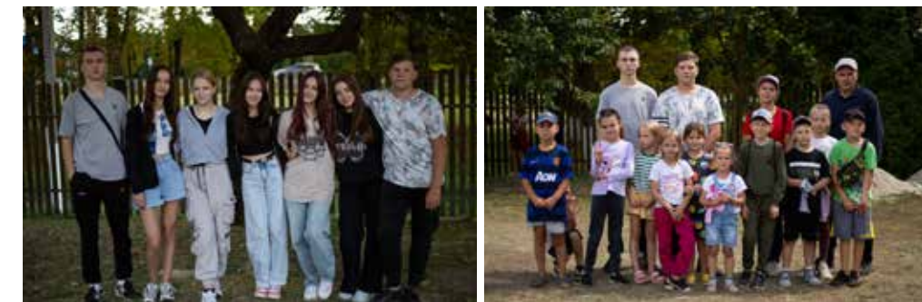
(Left) Teenagers at the camp; (right) younger campers.

This past summer, for the first time in five years, we managed to hold a children's Christian camp. At first the COVID pandemic prevented us, then the war. We decided to resume this ministry, because we have already been living in wartime conditions for a long time and we do not know when it will end. The children's camp lasted three days and 57 children came. They said that they had been waiting for the Christian camp all these years. Tears came to our eyes when we saw the children