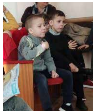
Boys who had a conflict.