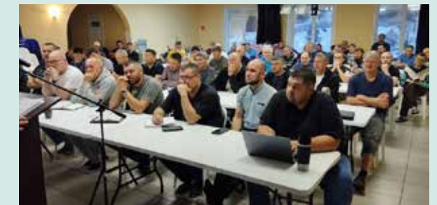
Pastoral conference in Belarus.

SGA exists to serve the Bible-preaching churches of the former Soviet Union, Eastern Europe, and in Israel. Helping to equip the faithful missionary pastors of the churches is one of the paramount ways we do this with your support. Your generous gifts not only help support the pastors and their families in ministry , but also provide Bibles and Christian literature, Bible and theological training, Compassion Ministry, children's ministries, and so much more. We are so thankful for you and each one of our partners. Please pray about how you can help today. ♦