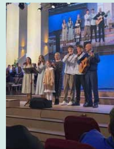
Youth forum in Belarus.

Of all the ministries the Lord has enabled SGA to support, Bible training remains the top priority of the churches we serve, and thus remains our top priority. SGA-supported seminaries and Bible institutes help