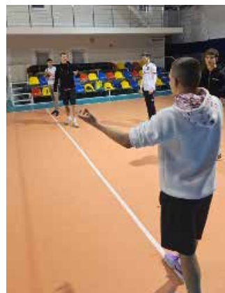
Volleyball with youth.

Please keep me in prayer that I can wisely answer the questions of unbelievers and build up believers! ♦