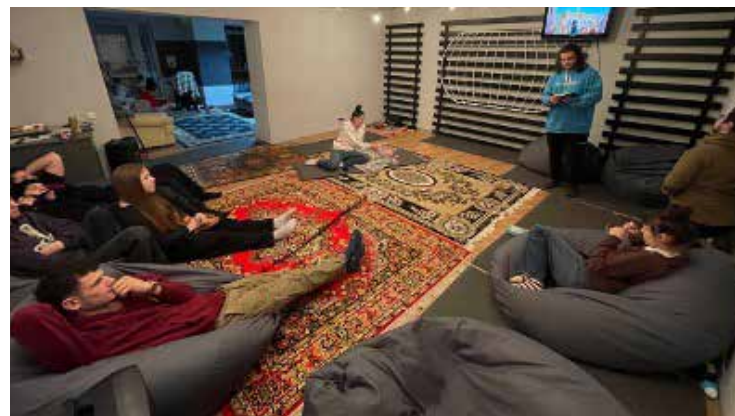
Young people participate in ministry and preaching.