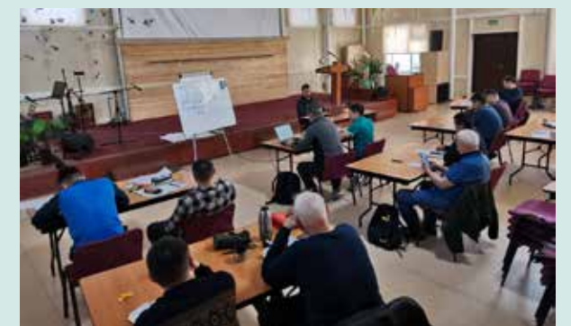
Antioch Initiative class in Yakutsk.

Your prayers and faithful support also helps provide Bibles and Christian literature, support for children's ministries such as Orphans Reborn, Summer Bible Camps, Immanuel's Child , and vitally important Compassion Ministry to needy families. We are so thankful for all that you do. Please be in prayer about how you can help today! ♦