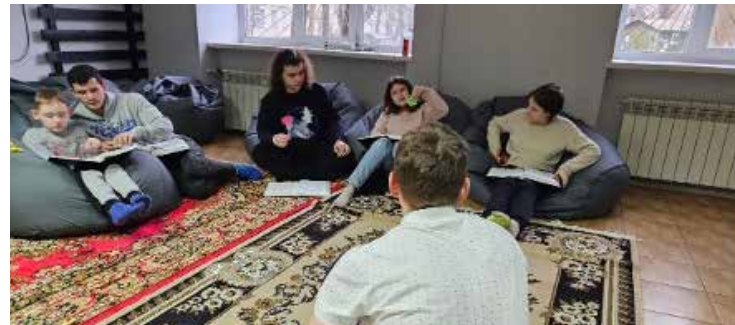
Meeting with youth.

We thank God for the youth. Our meetings, communication, games, and reading the Bible