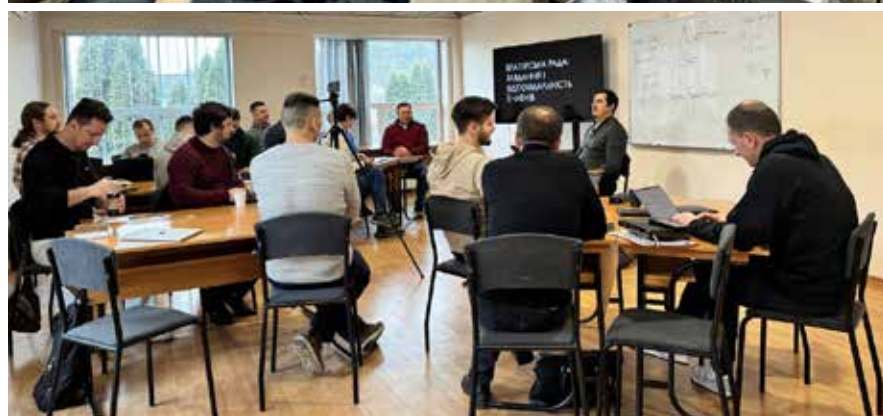
Classes at Irpen Biblical Seminary.