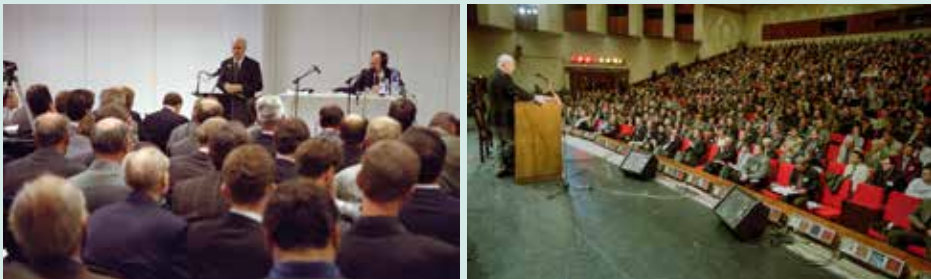
Dr. John MacArthur at pastor's conferences across the former Soviet Union.

Overall, it was a great privilege and blessing for SGA to serve with this great and humble servant of the Most High. It was one surpassing blessing after another. We are so grateful and humbled by Dr. MacArthur's ministries with SGA. ♦