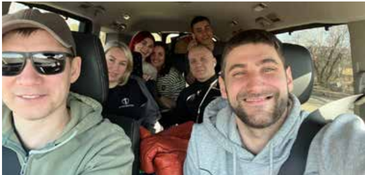
Driving to Khakassia.