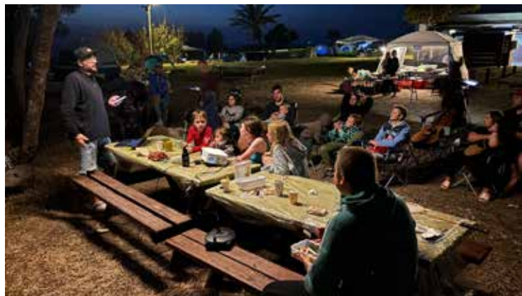
Studying God's Word with the children.

It was the first time for our young church to participate in such a camp outreach. The children participated in a quest, completing various intellectual and physical tasks, as a result of which they were rewarded with "artifacts," which would of