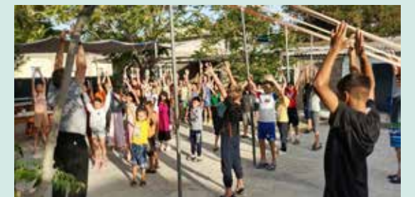
Bible camp in Central Asia.

Your faithful and generous support helps accomplish this and so much more—provision of Bibles and Christian literature , Compassion Ministry , children's outreaches such as Summer Bible Camps , Orphans Reborn , and Immanuel's Child , as well as provision for the ministries of missionary pastors. Please pray about how you can help today! ♦