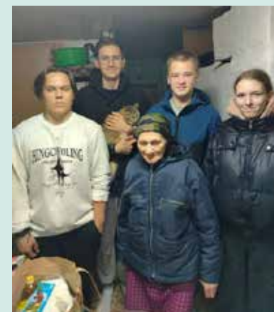
Compassion Ministry in Russia.

SGA-supported Bible training—as noted this month in our feature article on the late Dr. John MacArthur—has