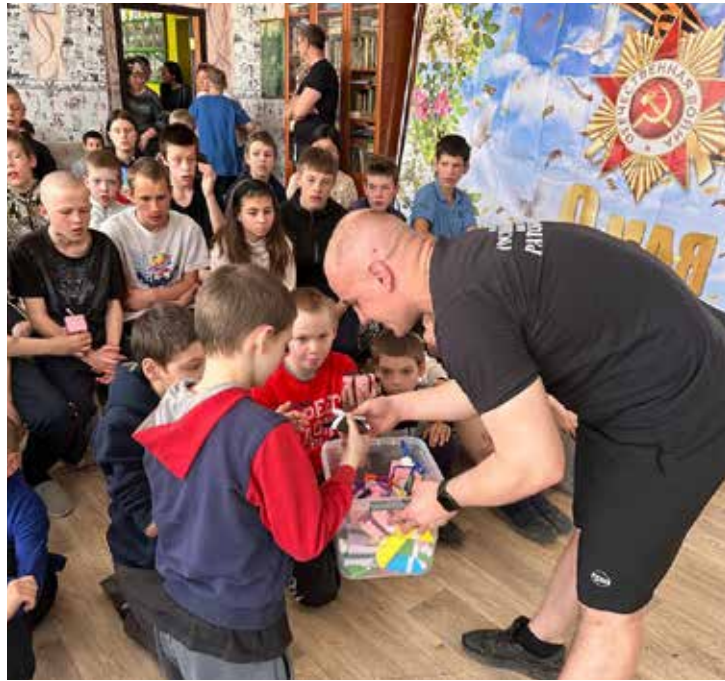
Visiting the orphanage at Lebyazhye.

The next morning, our two teams headed to an orphanage at Lebyazhye. We talked about fears, and that it is okay to be afraid. But there is One who