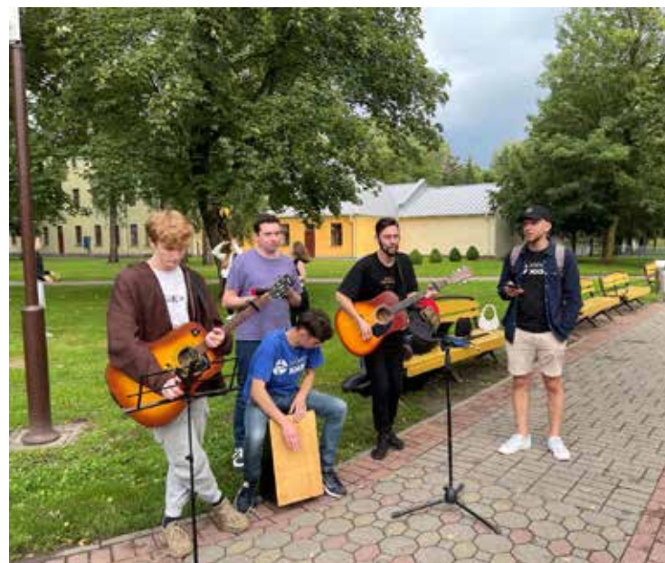
Singing in the park.

share Christ with unbelievers by visiting people in their homes and meeting with them on the streets. It was a blessed time for our two evangelism teams. We ended every conversation with prayer. We also visited former church members. Everyone welcomed