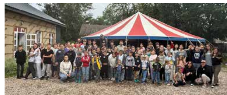
Summer Bible School.

In July and August, we held Summer Bible School. A total of 58 children attended, and more than half of the children were from non-believing families. We are grateful to the Lord!