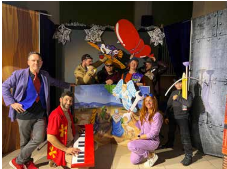
Orphans Reborn team in their Christmas play costumes.

Every year, our team prepares a new play about Christmas. The children look forward to it with such excitement! Last year, we held 25 performances—certainly a record-breaking number! Some of the locations were 300 miles away. We were also able to give about 700 gifts to the orphans.