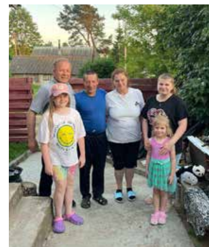
Witnessing to a family.

This past summer, we held practical classes on evangelism for students at the (SGA-supported) Minsk Theological Seminary. Together, we learned to