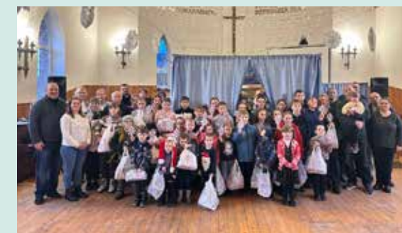
Immanuel's Child outreach in Belarus.

November begins the holiday season, at least here in the U.S. starting with Thanksgiving. Then, before we know it, Christmas time has arrived. The faithful churches SGA serves across the former Soviet Union are busily gearing up for this year's Immanuel's Child outreach, and more are celebrating