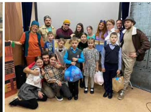
Children with their gifts after the performance.