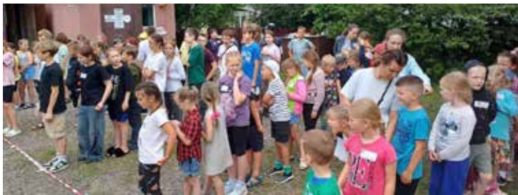
Children at the summer camp.

W e especially felt God's presence in our church as last summer wound down. God gave us the opportunity to hold another camp for needy children. Since we could not accommodate all of them during the first three camps, there were still children who really wanted to be there. With God's help, we were able to acquire the funds to hold the event. Once again, a good, close-knit ministry team was formed. When I prayed with them in the morning, I saw how they spoke with love and joy about the previous days spent with the children. Together we thanked God for each day!