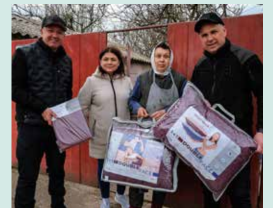
Operation Winter Warmth in Ukraine.

Wintertime across the former Soviet Union is beyond harsh. The bitter winter temperatures of Siberia and the Arctic regions are legendary, often plunging to double-digits below zero. This reality is what makes SGA-supported Compassion Ministry so very important, enabling churches to reach needy families with aid that they so urgently need. Your gifts help provide so much more—support of sound Bible training, missionary pastors and evangelism, children's ministries such as Summer Bible Camps, Immanuel's Child and Orphans Reborn , plus distribution of Bibles and Christian literature. Please pray about how you can help today! ♦