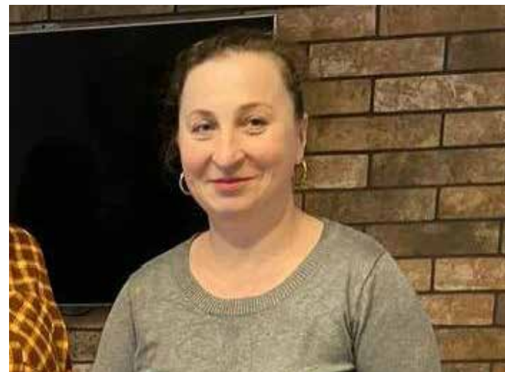
Other families helped through Compassion Ministry.

During this time, the family lost their property and their grandmother passed away. At the same time, they have developed friendships with all the members of the Bible study group. They learned about God and continue to study the Word of God. During the period of loss of a loved one, they experienced what a Christian family is, and how to support and bear each other's burdens. They are still on the way to making the most important