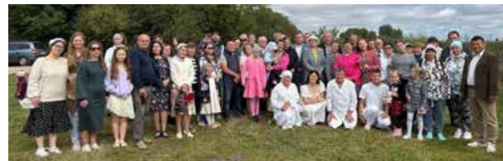
Baptism of new believers.

September was also a special month for us. There was a joyful baptism event on the banks of our beautiful river and a celebration at church. Two sisters and one brother entered into a covenant with God. I am glad that both young and middle-aged people are coming to the Lord.