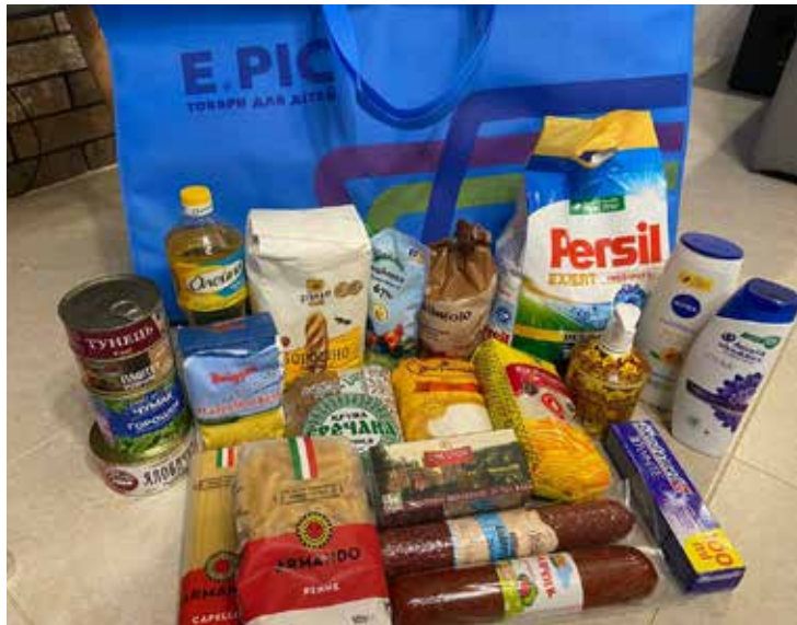
Food package for a family.

Thank you for your help! The people were touched by your care, as they have not received such wonderful help for a very long time. We were very careful to buy good quality food and hygiene products.