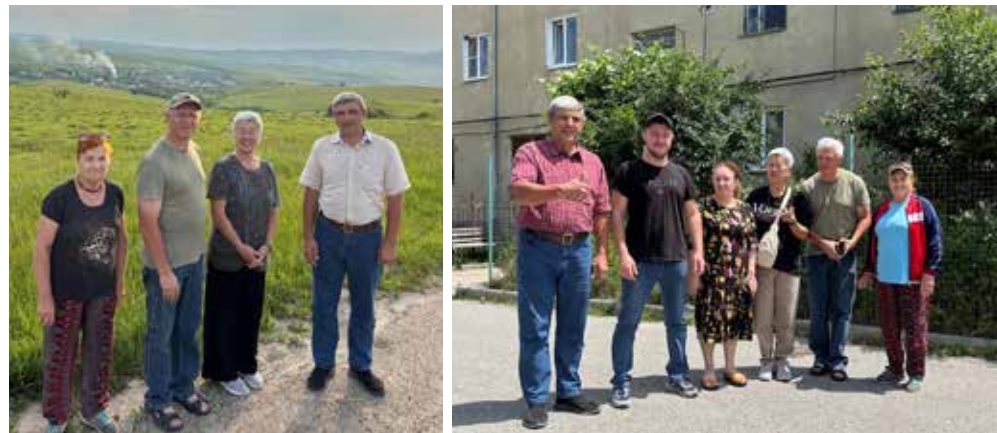
(Left to Right) Praying for the village; reaching local people.

SGA-Supported Missionary Pastor in Russia's Volgograd Region