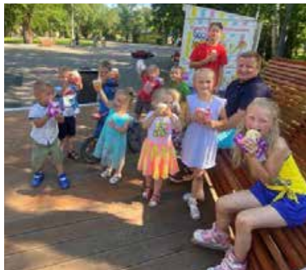
Spending time with the six children.

We pray for God to direct us in what to do in the long term, while experts say that in our neighborhood it would not be possible. But we know that nothing is impossible for our God. We know that God is in control and He will see things out, though we are not fully convinced that God is directing us to take these children into our family. Thank you for your continued prayerful and financial support! Please pray also for these six children. ♦