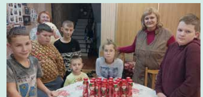
Visiting a family-style orphanage in Belarus.

Reaching lonely, forgotten orphan children with Christ’s love is just one of the many ministries carried out by the faithful churches SGA serves across the former Soviet Union. Through Orphans Reborn , many of these boys and girls are receiving much needed love and care, and above all—the life-changing Gospel of Jesus Christ . Your gifts and prayers help accomplish not only this, but also provision of Bibles and Christian literature, other children’s outreaches such as Immanuel’s Child at Christmas and Summer Bible Camps , sound Bible training, and so much more. Please pray about how you can help today! ♦