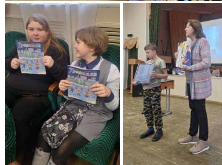
Visiting the orphanage.

did not swear and he would try not to swear at all. She gave him some chocolate and he gave her a big hug. Such small details may seem unimportant, but we see God at work in even these small results. Please keep praying for these children, that more will come to the Lord in faith. ♦