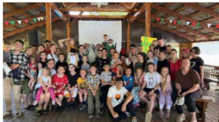
Children at the summer camp.

The last time I wrote that we were praying and thinking about taking more children into our family. I prayed for God to show His will in the near future.