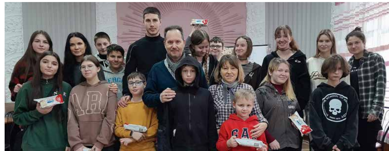
Visiting children at the Social Services Center.