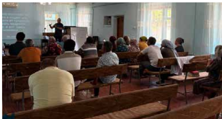
Services in different languages allow all in attendance to hear and understand God's Word.

A month ago, our church council raised the issue of the spiritual well-being of our children and proposed that the first sermon in the services be delivered in our language, and the second in Russian, with a separate message for the children. This was agreed on, and initially this was received with caution by our Russian-speaking congregation. But gradually, the church is becoming accustomed to this "unusual" arrangement.