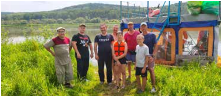
Rafting trip for fathers and sons.

Next we had a family rafting trip. This one was mainly for fellowship and recreation for all the Christian families. The goal of that trip was to help with building relationships among husbands and wives, and among parents and children. In such a way we helped to build unity in families. Healthy families build healthy churches.