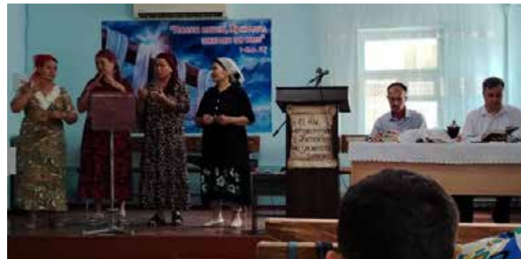
Signing during the service.

Last spring, we held a large fellowship for the deaf. For five days, 35–45 deaf people were able to