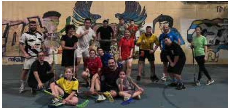
Top: Friday worship service; Above: Sports club.

for the blessing of Israel and coming of new people to Christ. We run a small group of Bible study and a floorball sports club in the middle of the week.