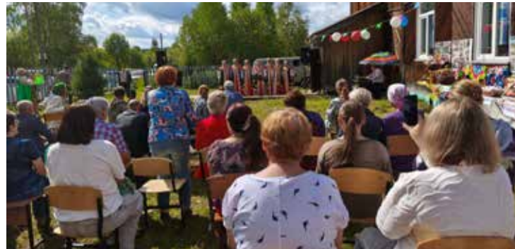
Anniversary celebration in the village of Kandat.

After similar outings, mid-August was the end