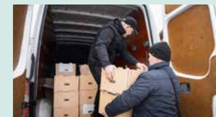
Delivering boxes of aid in Ukraine.

Throughout Scripture, we can learn of our faithful God's compassion for the poor and downtrodden. The Lord Jesus modeled true compassion during His earthly ministry, and He expects His people to follow His example. Our brothers and sisters across the former Soviet Union and Eastern Europe are thankful for your provision in helping them render aid to the needy. Your gifts accomplish so much more—provision of Bibles and Christian literature, Bible training, children's ministries, missionary pastor support, and so much more. Please pray about how you can help today! ♦