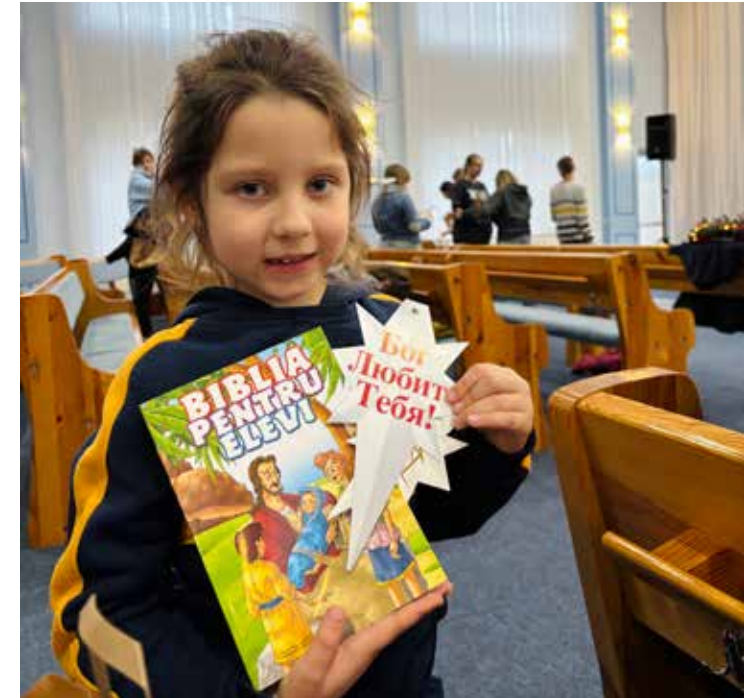
A young girl with a Bethlehem star and a Student Bible.

Thanks to your sacrifice in giving, each child received a gift with sweets, hygiene items, gloves and socks, and school supplies. The children were very happy. Each child also received a small star with the message "God loves you," and together they prayed for the people who made these gifts possible. The Student Bible was one of their favorite gifts because of the colorful pictures and easy-to-read text.