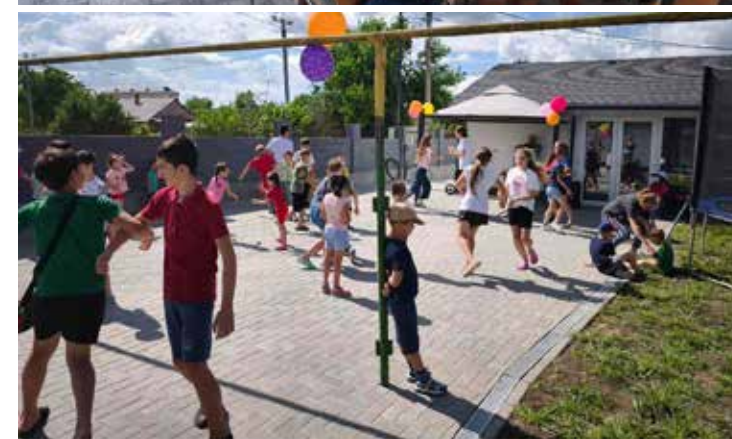
Top: Singing songs; Above: Playing games during the camp.