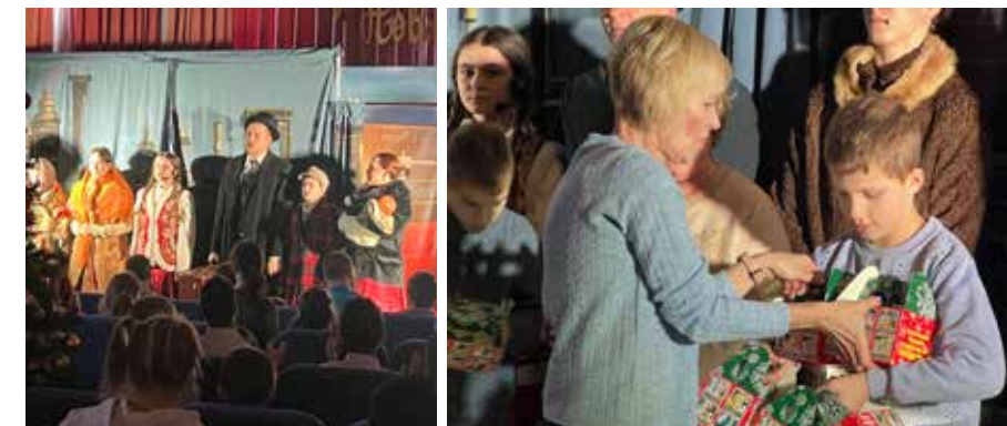
L to R: Actors perform during the event; Distributing presents to children.