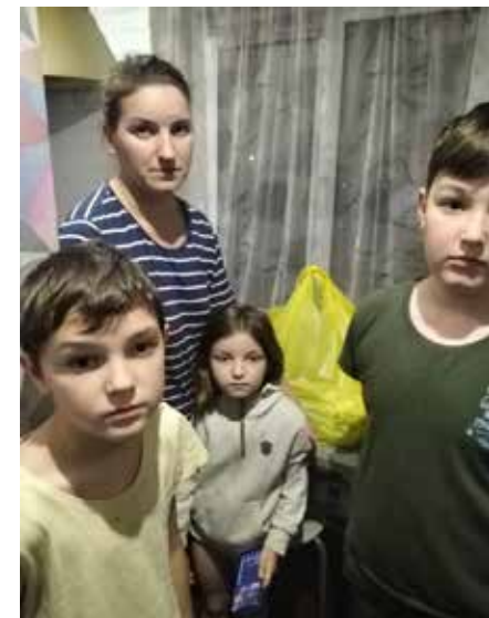
Bringing groceries to a family.