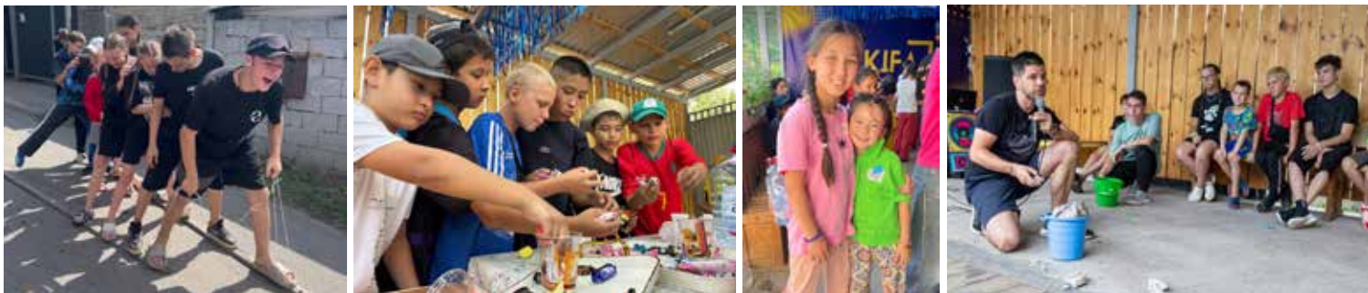
Children participate in activities at the camps and outreaches.

Some of them were baptized this year, while others are in the process of growing spiritually. Today they are already taking on responsibilities, helping in organization, and serving other children. This is a clear testimony that the seeds planted years ago are now bearing fruit. What inspires us even more is that this year graduates of orphanages also served with us. Just a few years ago, they