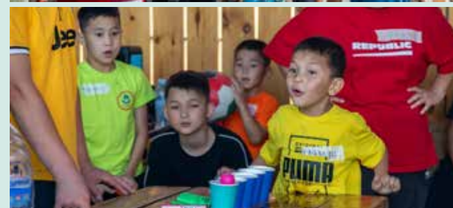
Children's camps and outreaches in Kazakhstan.

Tens of thousands of children across the former Soviet countries look forward eagerly to summer and camp season. Not only is it a break from school, but it is also a time of great fun and fellowship. Camps have been part of their tradition dating back to the Soviet Pioneer Camps. When atheistic communist rule ended, the faithful churches SGA serves stepped in and held their own Summer Bible Camps, making them Gospel-focused. Your support for these camp outreaches is deeply appreciated, along with all the other ministries you support through SGA— Orphans Reborn and other children's outreaches, Bible training, provision of Bibles and Christian literature, Compassion Ministry, and so much more. Please pray about how you can help today! ♦