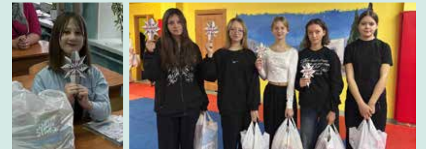
Immanuel's Child in Russia.

The churches and faithful missionary pastors supported by SGA are truly the foundation of almost all ministry taking place across the nations of the former Soviet Union. They shepherd their congregations, plant new ones, conduct and oversee evangelistic outreaches, render aid to the needy, and disciple new leaders for the churches. Your faithful prayers and support help them accomplish all of this for the glory of Christ. You also help provide Bibles and Christian literature, support doctrinally