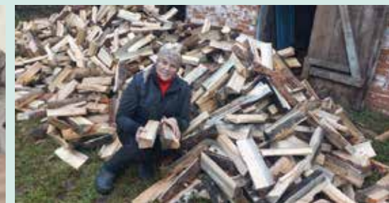
L to R: Visiting widows; Firewood for a needy widow.

sound Bible training, equip children's ministries such as Summer Bible Camps, Orphans Reborn , Immanuel's Child ministries at Christmas, and so much more. Please pray about how you can help today. ♦