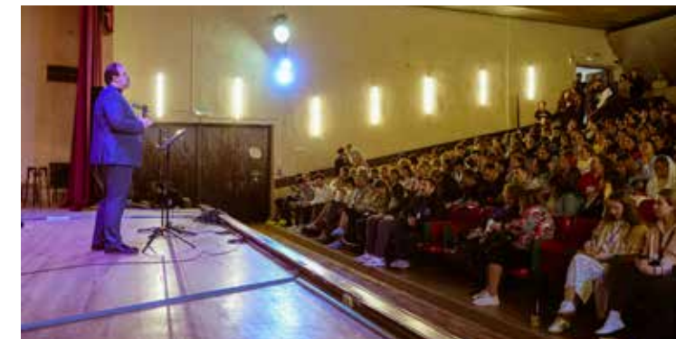
Conference for Russian Children's Ministers.

participant got a bag with presents. There was also a book edited by SGA, Ten Commandments. It is a very good tool to teach the children.