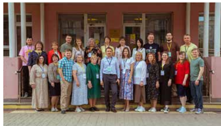
Conference for regional leaders.

a wonderful time for communication, education and relaxation. My husband and I have heard a lot of important information, not only for the ministry, but also for the upbringing of our children. All the topics were relevant and interesting. May the Lord bless the whole team, and give us wisdom in the future." We