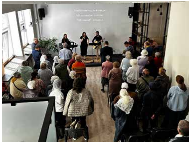
Believers in Ukraine worship together.

To someone far away, that may seem small. But here, it isn't. So today, from a war-weary, yet Christ-proclaiming, community of believers in Ukraine, we simply want to say: THANK YOU. Thank you for praying and giving when no one was watching. And above all—thank You, Lord, for uniting us as one Body, for teaching us what love looks like, and for sustaining Your Church even in the shadow of war. We may be separated by borders, languages, and oceans. But in Christ, we are one—and by His mercy, we are still here!" ♦