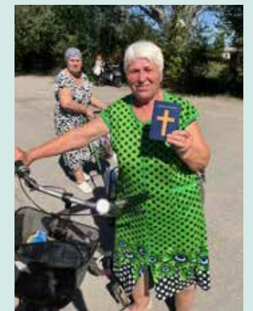
Distributing Bibles and aid.

making a great difference—sharing the love of Christ and the hope of the Gospel. Your gifts help accomplish so much more: Bible training, provision of Bibles and Christian literature, Summer Bible Camps and other children's ministries, Compassion Ministry, and support of missionary pastors. Please pray about how you can help today! ♦