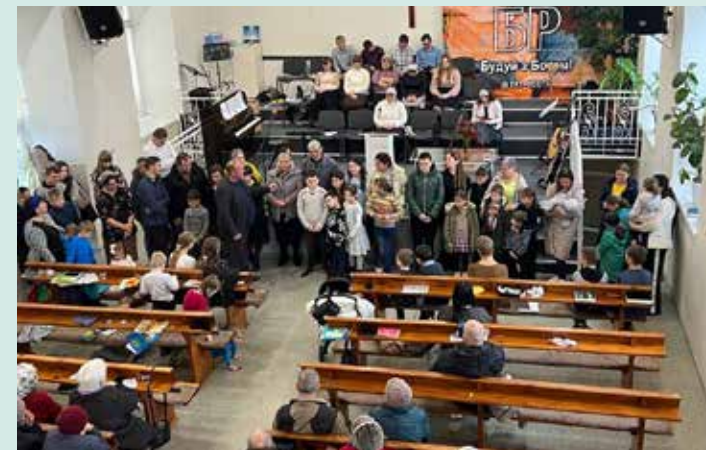
Praying for orphaned children.

Children across the former Soviet Union who are in orphanages face challenges that children raised by loving parents in a good home don't face. In addition to the emotional scars left in their hearts and minds, many of them end up in crime, drug abuse, alcoholism, or even prostitution once they have to leave the orphanage at age 18. It is into these young lives that the SGA-supported Orphans Reborn ministry is