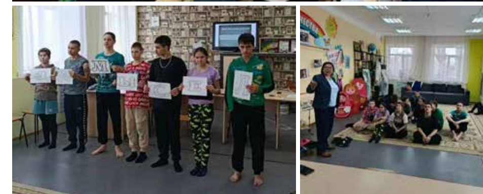
Lessons with children in the orphanage.

Resurrection of Christ. In conclusion, we highlighted the key points: His victory over sin and Satan, His triumph over death and hell, and His gift of eternal life which He offers to us all.