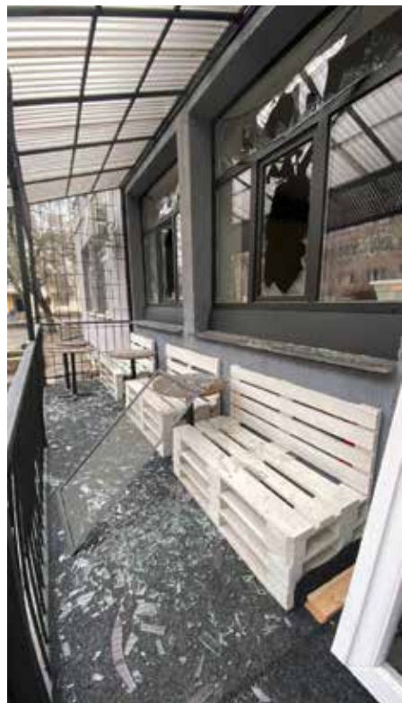
Destruction from the war.

To someone far away, that may seem small. But here, it isn't. So today, from a war-weary, yet Christ-proclaiming, community of believers in Ukraine, we simply want to say: THANK YOU. Thank you for praying and giving when no one was watching. And above all—thank You, Lord, for uniting us as one Body, for teaching us what love looks like, and for sustaining Your Church even in the shadow of war. We may be separated by borders, languages, and oceans. But in Christ, we are one—and by His mercy, we are still here!" ♦