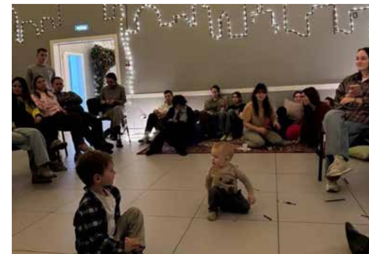
Youth Christmas Eve event.